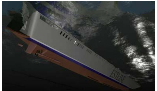
Flooding scenario simulated by Proteus3